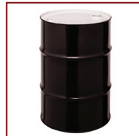
ET-S Oils Drum (55 Gal - 208 Lt)