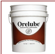
ET-S Oils Pail (5 Gal- 18.9 Lt)