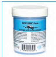
70302-L (4 oz - 113 g)