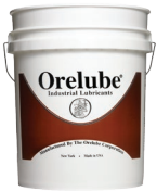
ET-S Oils Pail (5 Gal - 18.9 Lt)