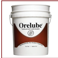
ET-2G Pail (35 Lb - 15.9 Kg)