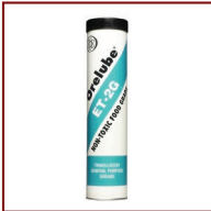
ET-2G Cartridge (14.5 oz - 411 g)