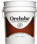
ET-2B Pail (35 Lb - 15.9 Kg)