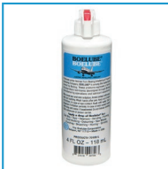
70106-L (4 oz - 118 ml)