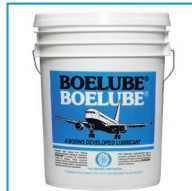
70106-05 (5 gal - 18.9 l)