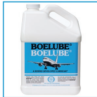
70106-04 (1 gal - 3.8 l)