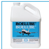
70090-04 (1 gal - 3.8 l)