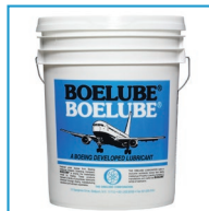
70090-05 (5 gal - 18.9 l)