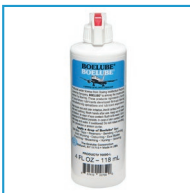
70090-L (4 oz - 118 ml)