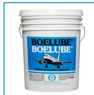
70307-05 (35 lb - 16 kg)