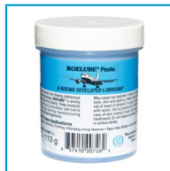
70307-L (4 oz - 113 g)