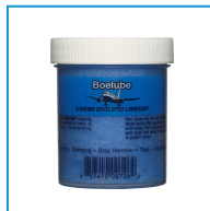
70302-L (4 oz - 113 g)