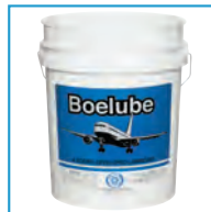
70302-05 (35 lb - 16 kg)