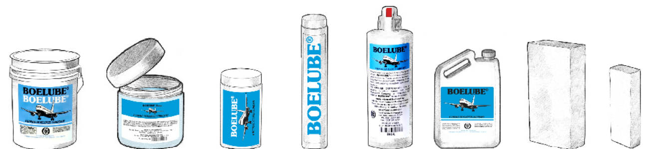
5 Gallon Pail (18.9 liter)